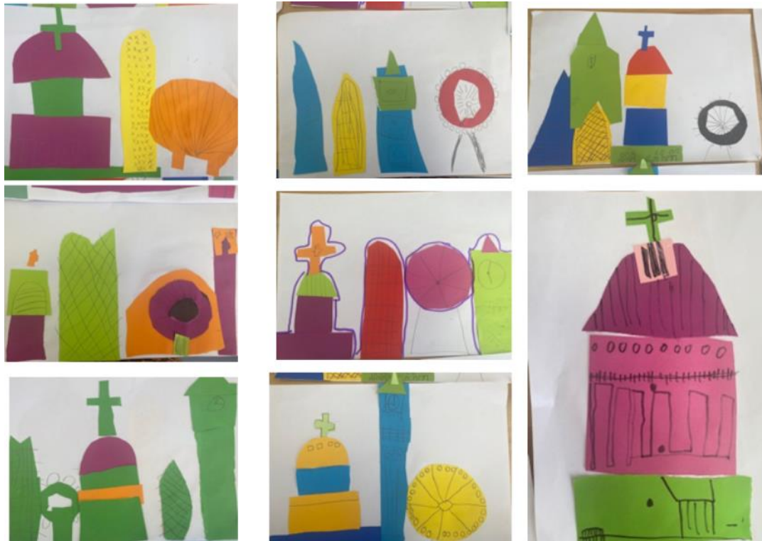
Year 4 - Terrible Tudors and Portraits